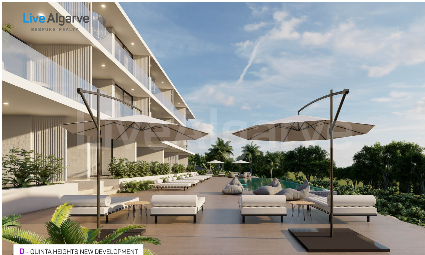
D - QUINTA HEIGHTS NEW DEVELOPMENT