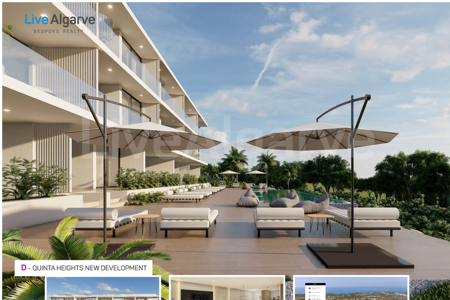
D - QUINTA HEIGHTS NEW DEVELOPMENT