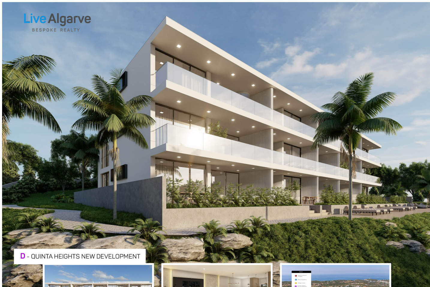
D - QUINTA HEIGHTS NEW DEVELOPMENT